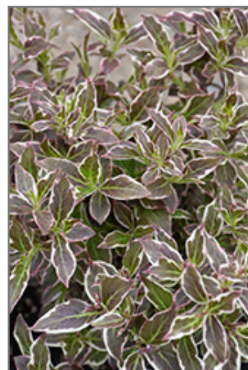
My Monet Purple Effect Weigela foliage