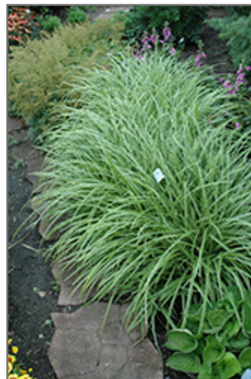
Ice Dance Sedge