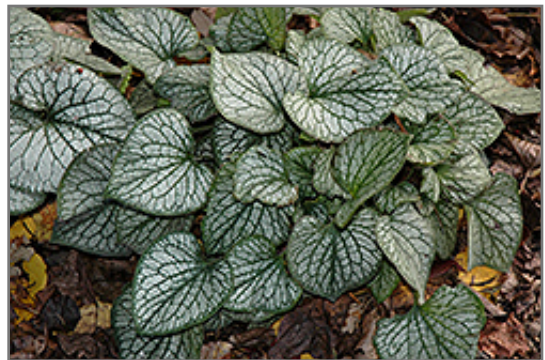
Jack Frost Bugloss foliage

Jack Frost Bugloss is recommended for the following landscape applications;