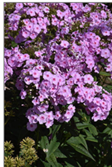
Luminary Opalescence Garden Phlox flowers

Luminary Opalescence Garden Phlox is recommended for the following landscape applications;