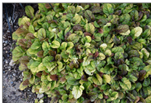
Feathered Friends Parrot Paradise Bugleweed