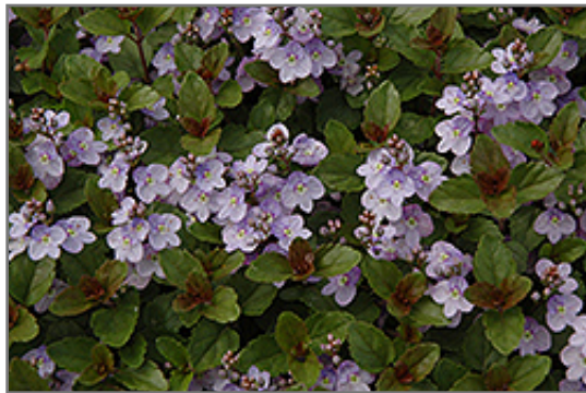
Waterperry Blue Speedwell flowers