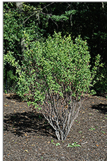
Rainbow Pillar Serviceberry

This is a relatively low maintenance shrub, and should not require much pruning, except when necessary, such as to remove dieback. It is a good choice for attracting birds to your yard, but is not particularly attractive to deer who tend to leave it alone in favor of tastier treats. It has no significant negative characteristics.