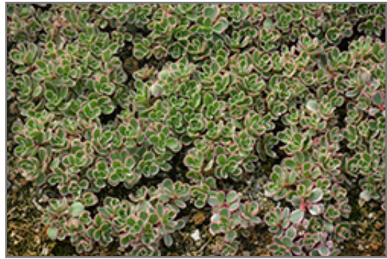
Tricolor Stonecrop flowers

Tricolor Stonecrop will grow to be only 4 inches tall at maturity, with a spread of 18 inches. When grown in masses or used as a bedding plant, individual plants should be spaced approximately 15 inches apart. Its foliage tends to remain low and dense right to the ground. It grows at a fast rate, and under ideal conditions can be expected to live for approximately 10 years. As an herbaceous perennial, this plant will usually die back to the crown each winter, and will regrow from the base each spring. Be careful not to disturb the crown in late winter when it may not be readily seen!