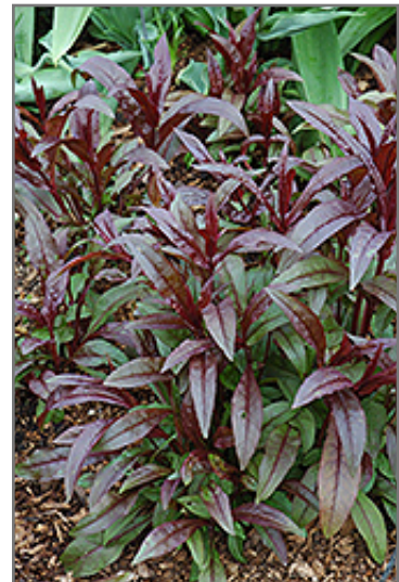
Husker Red Beard Tongue foliage