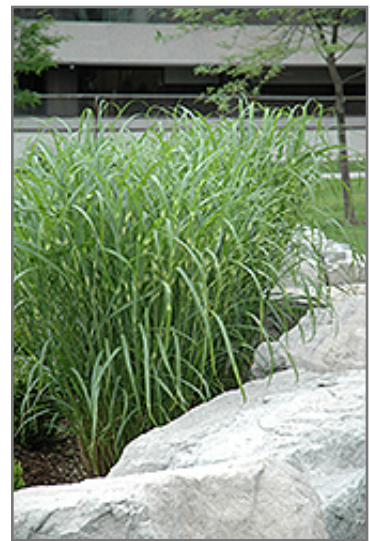
Zebra Grass