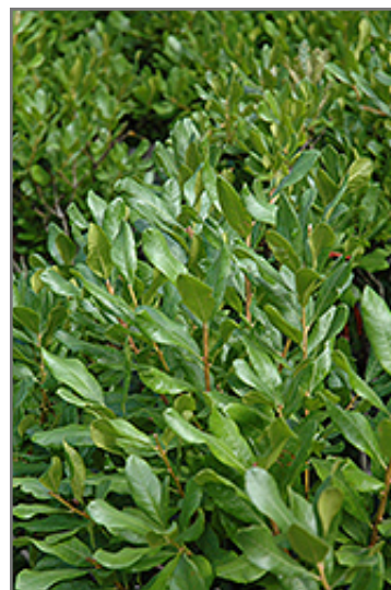
Northern Bayberry foliage