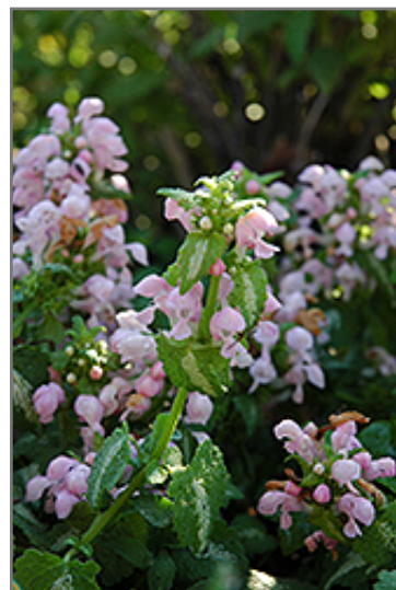
Shell Pink Spotted Dead Nettle flowers