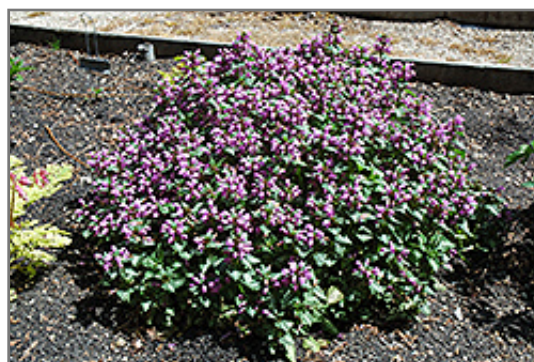
Beacon Silver Spotted Dead Nettle in bloom