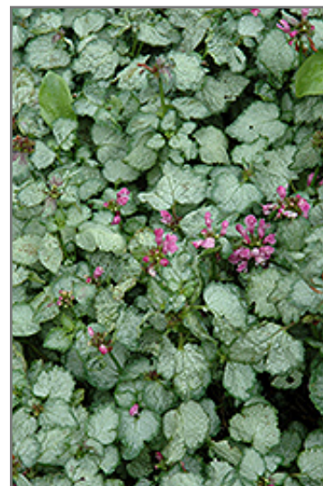
Beacon Silver Spotted Dead Nettle flowers