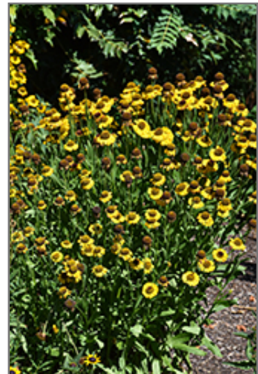
Salud Golden Sneezeweed in bloom