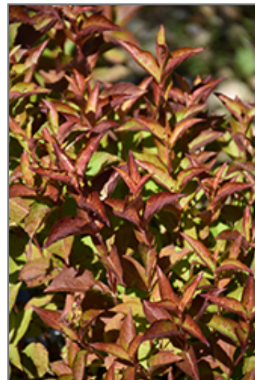
Date Night Strobe Weigela foliage