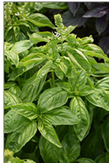
Genovese Basil foliage

Genovese Basil will grow to be about 20 inches tall at maturity, with a spread of 14 inches. When grown in masses or used as a bedding plant, individual plants should be spaced approximately 12 inches apart. This fast-growing annual will normally live for one full growing season, needing replacement the following year.