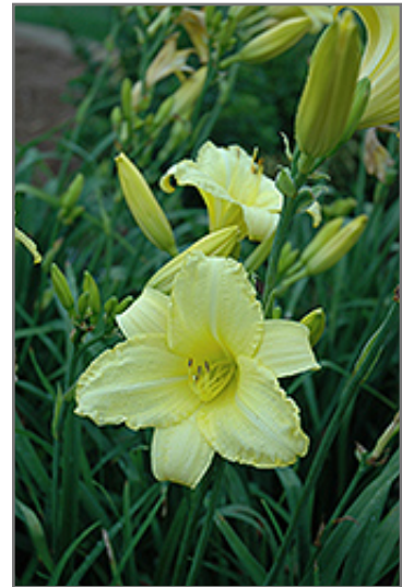
Happy Ever Appster Happy Returns Daylily flowers

Happy Ever Appster Happy Returns Daylily is recommended for the following landscape applications;