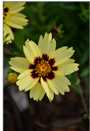
UpTick Cream and Red Tickseed flowers

UpTick Cream and Red Tickseed is recommended for the following landscape applications;