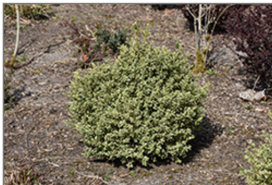
Wedding Ring Boxwood