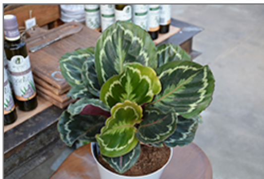
Medallion Rose Painted Calathea in full

This is an herbaceous houseplant with an upright spreading habit of growth. Its relatively coarse texture stands it apart from other indoor plants with finer foliage. This plant should not require much pruning, except when necessary to keep it looking its best.