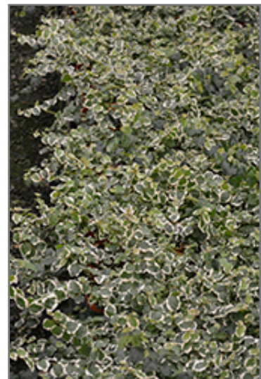
Variegated Creeping Fig in full