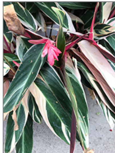
Tricolor Stromanthe flowers

This plant does best in full sun to partial shade. It prefers to grow in average to moist conditions, and shouldn't be allowed to dry out. It is not particular as to soil pH, but grows best in rich soils. It is somewhat tolerant of urban pollution. This is a selected variety of a species not originally from North America. It can be propagated by division; however, as a cultivated variety, be aware that it may be subject to certain restrictions or prohibitions on propagation.