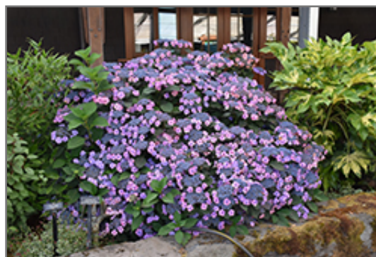
Tuff Stuff Hydrangea in bloom