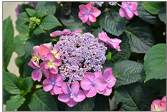
Tuff Stuff Hydrangea flowers

Tuff Stuff Hydrangea makes a fine choice for the outdoor landscape, but it is also well-suited for use in outdoor pots and containers. With its upright habit of growth, it is best suited for use as a 'thriller' in the 'spiller-thriller-filler' container combination; plant it near the center of the pot, surrounded by smaller plants and those that spill over the edges. It is even sizeable enough that it can be grown alone in a suitable container. Note that when grown in a container, it may not perform exactly as indicated on the tag - this is to be expected. Also note that when growing plants in outdoor containers and baskets, they may require more frequent waterings than they would in the yard or garden.