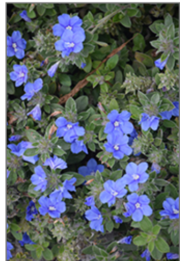
Blue My Mind Morning Glory flowers

Blue My Mind Morning Glory is recommended for the following landscape applications;