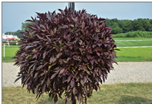
Illusion Garnet Lace Sweet Potato Vine