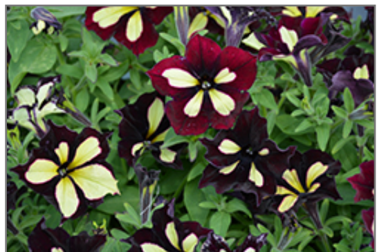
Crazytunia Star Jubilee Petunia flowers