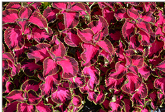
Chocolate Covered Cherry Coleus foliage

Chocolate Covered Cherry Coleus is a fine choice for the garden, but it is also a good selection for planting in outdoor containers and hanging baskets. It is often used as a 'filler' in the 'spiller-thriller-filler' container combination, providing a canvas of foliage against which the larger thriller plants stand out. Note that when growing plants in outdoor containers and baskets, they may require more frequent waterings than they would in the yard or garden.