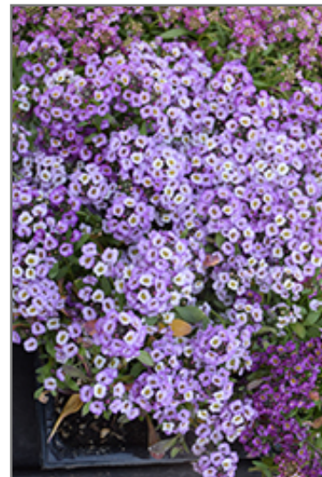
Clear Crystal Lavender Shades Sweet Alyssum flowers

Clear Crystal Lavender Shades Sweet Alyssum is recommended for the following landscape applications;