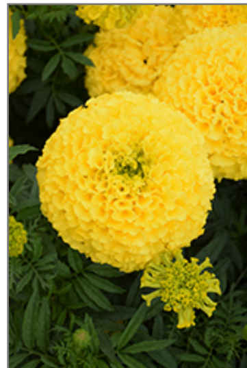
Marvel Yellow Marigold flowers

Marvel Yellow Marigold is recommended for the following landscape applications;