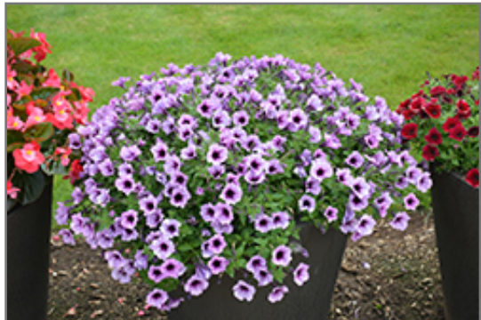
Supertunia Bordeaux Petunia in bloom

Supertunia Bordeaux Petunia is a fine choice for the garden, but it is also a good selection for planting in outdoor containers and hanging baskets. Because of its trailing habit of growth, it is ideally suited for use as a 'spiller' in the 'spiller-thriller-filler' container combination; plant it near the edges where it can spill gracefully over the pot. Note that when growing plants in outdoor containers and baskets, they may require more frequent waterings than they would in the yard or garden.