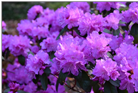
P.J.M. Elite Rhododendron flowers

P.J.M. Elite Rhododendron is recommended for the following landscape applications;