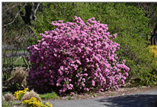
P.J.M. Elite Rhododendron in bloom