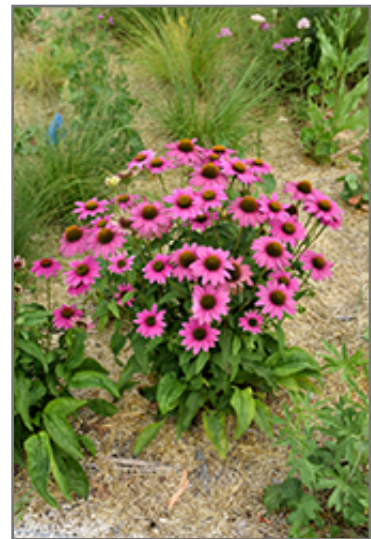
PowWow Wild Berry Coneflower in bloom

This is a relatively low maintenance plant, and is best cleaned up in early spring before it resumes active growth for the season. It is a good choice for attracting birds and butterflies to your yard, but is not particularly attractive to deer who tend to leave it alone in favor of tastier treats. It has no significant negative characteristics.