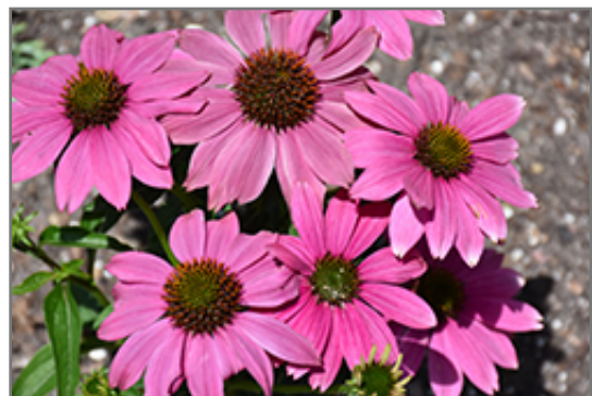
PowWow Wild Berry Coneflower flowers