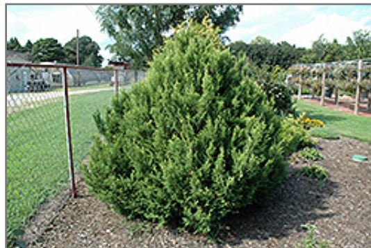
Cream Ball Falsecypress

Cream Ball Falsecypress is recommended for the following landscape applications;