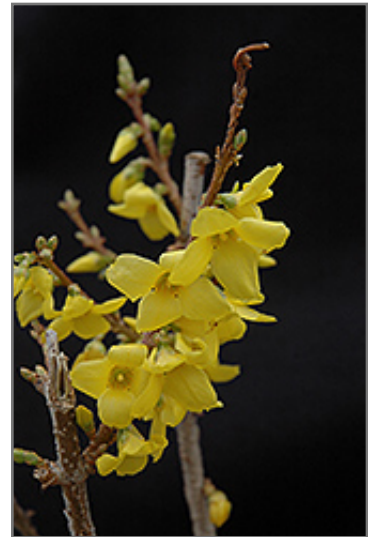
Show Off Forsythia flowers

Show Off Forsythia makes a fine choice for the outdoor landscape, but it is also well-suited for use in outdoor pots and containers. With its upright habit of growth, it is best suited for use as a 'thriller' in the 'spiller-thriller-filler' container combination; plant it near the center of the pot, surrounded by smaller plants and those that spill over the edges. It is even sizeable enough that it can be grown alone in a suitable container. Note that when grown in a container, it may not perform exactly as indicated on the tag - this is to be expected. Also note that when growing plants in outdoor containers and baskets, they may require more frequent waterings than they would in the yard or garden.