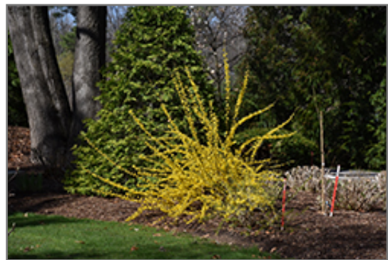
Show Off Forsythia in bloom