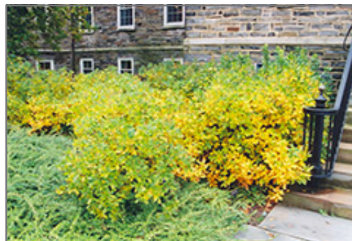
Summersweet in fall

Summersweet is recommended for the following landscape applications;