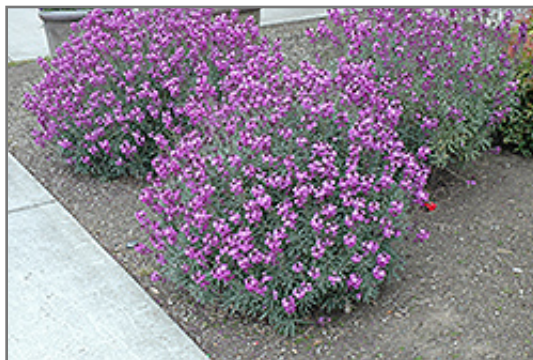
Bowles Mauve Wallflower in bloom