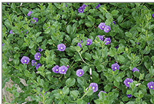
Miniature Morning Glory in bloom