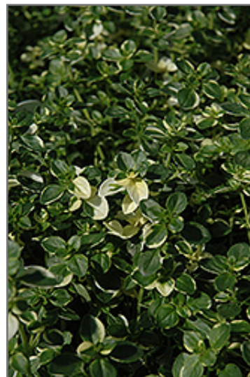
Variegated Broadleaf Thyme foliage