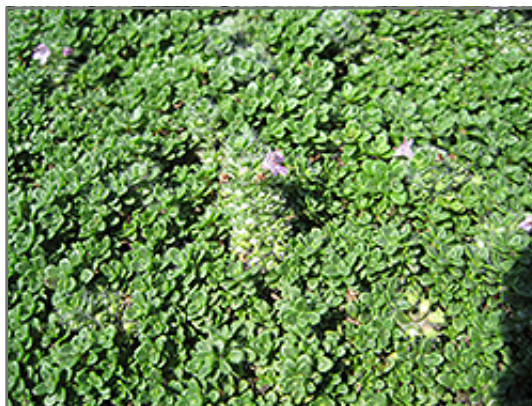
Elfin Creeping Thyme in bloom

This plant will require occasional maintenance and upkeep, and is best cleaned up in early spring before it resumes active growth for the season. Deer don't particularly care for this plant and will usually leave it alone in favor of tastier treats. Gardeners should be aware of the following characteristic(s) that may warrant special consideration;