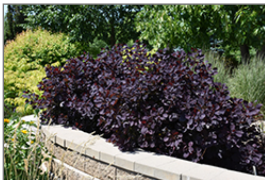
Royal Purple Smokebush