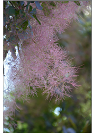
Royal Purple Smokebush flowers

This shrub should only be grown in full sunlight. It is very adaptable to both dry and moist locations, and should do just fine under average home landscape conditions. It is not particular as to soil type or pH. It is highly tolerant of urban pollution and will even thrive in inner city environments, and will benefit from being planted in a relatively sheltered location. This is a selected variety of a species not originally from North America.