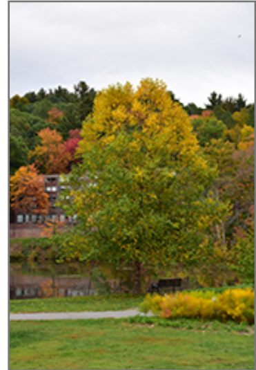
Heritage River Birch in fall

This tree does best in full sun to partial shade. It is quite adaptable, preferring to grow in average to wet conditions, and will even tolerate some standing water. It is not particular as to soil type, but has a definite preference for acidic soils, and is subject to chlorosis (yellowing) of the leaves in alkaline soils. It is highly tolerant of urban pollution and will even thrive in inner city environments. Consider applying a thick mulch around the root zone in winter to protect it in exposed locations or colder microclimates. This is a selection of a native North American species.