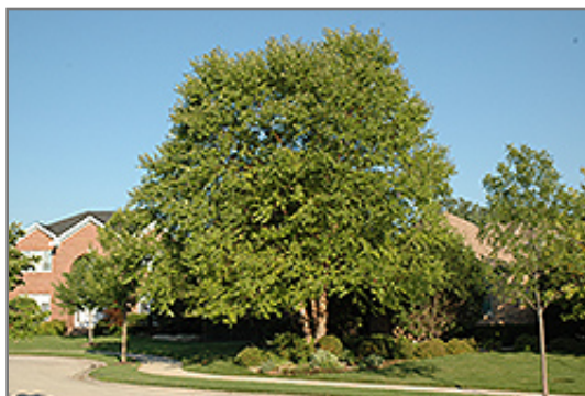
Heritage River Birch