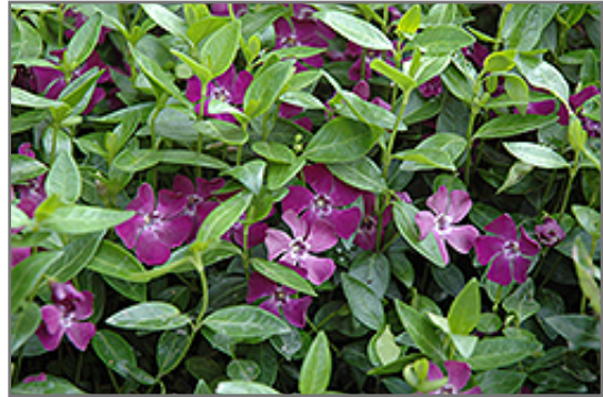
Burgundy Periwinkle flowers