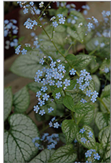
Jack Frost Bugloss flowers

Jack Frost Bugloss is a fine choice for the garden, but it is also a good selection for planting in outdoor pots and containers. It is often used as a 'filler' in the 'spiller-thriller-filler' container combination, providing a mass of flowers and foliage against which the thriller plants stand out. Note that when growing plants in outdoor containers and baskets, they may require more frequent waterings than they would in the yard or garden.