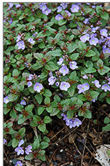
Waterperry Blue Speedwell in bloom