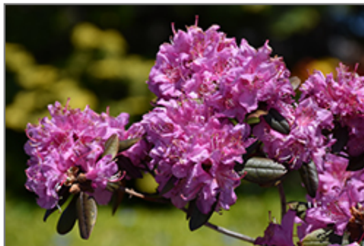
Midnight Ruby Rhododendron flowers