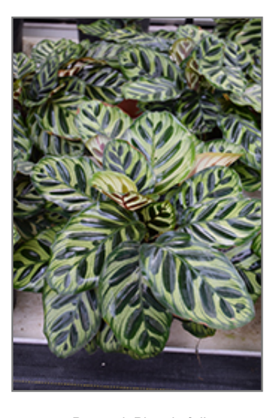
Peacock Plant in full

When grown indoors, Peacock Plant can be expected to grow to be about 24 inches tall at maturity, with a spread of 18 inches. It grows at a slow rate, and under ideal conditions can be expected to live for approximately 5 years. This houseplant should only be grown away from direct sunlight or in a room with strong artificial light. It does best in average to evenly moist soil, but will not tolerate standing water. The surface of the soil shouldn't be allowed to dry out completely, and so you should expect to water this plant once and possibly even twice each week. Be aware that your particular watering schedule may vary depending on its location in the room, the pot size, plant size and other conditions; if in doubt, ask one of our experts in the store for advice. It is not particular as to soil pH, but grows best in rich soil. Contact the store for specific recommendations on pre-mixed potting soil for this plant.