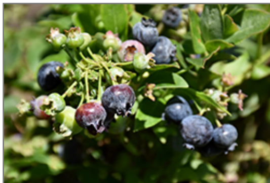
Jelly Bean Blueberry fruit