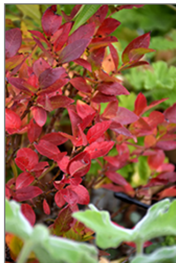
Jelly Bean Blueberry in fall

Jelly Bean Blueberry features dainty clusters of white bell-shaped flowers with shell pink overtones hanging below the branches in mid spring. It has red-variegated green foliage throughout the season. The glossy oval leaves turn an outstanding red in the fall. It features an abundance of magnificent blue berries in mid summer.