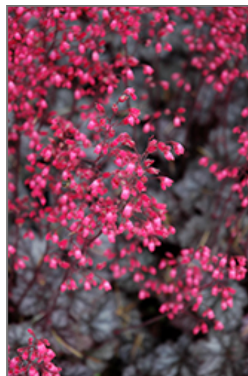
Glitter Coral Bells flowers