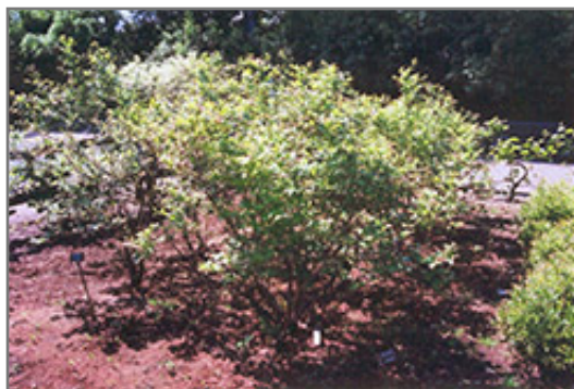
Northland Blueberry

This shrub does best in full sun to partial shade. It does best in average to evenly moist conditions, but will not tolerate standing water. It is very fussy about its soil conditions and must have sandy, acidic soils to ensure success, and is subject to chlorosis (yellowing) of the leaves in alkaline soils. It is quite intolerant of urban pollution, therefore inner city or urban streetside plantings are best avoided, and will benefit from being planted in a relatively sheltered location. Consider applying a thick mulch around the root zone in winter to protect it in exposed locations or colder microclimates. This is a selection of a native North American species.