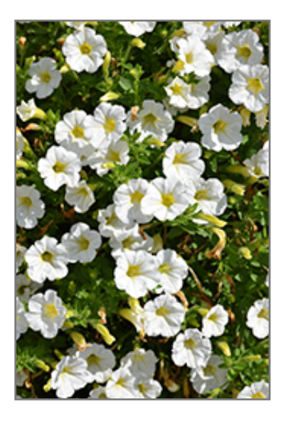
Littletunia White Grace Petunia flowers

Littletunia White Grace Petunia will grow to be about 12 inches tall at maturity, with a spread of 12 inches. When grown in masses or used as a bedding plant, individual plants should be spaced approximately 10 inches apart. Its foliage tends to remain dense right to the ground, not requiring facer plants in front. This fast-growing annual will normally live for one full growing season, needing replacement the following year.